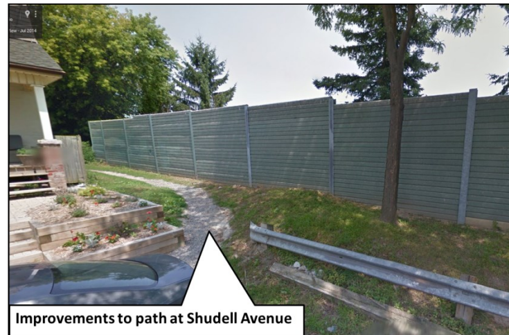
Improvements to path at Shudell Avenue